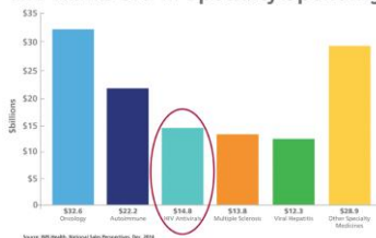
HIV Ranks 3rd in Specialty Spending